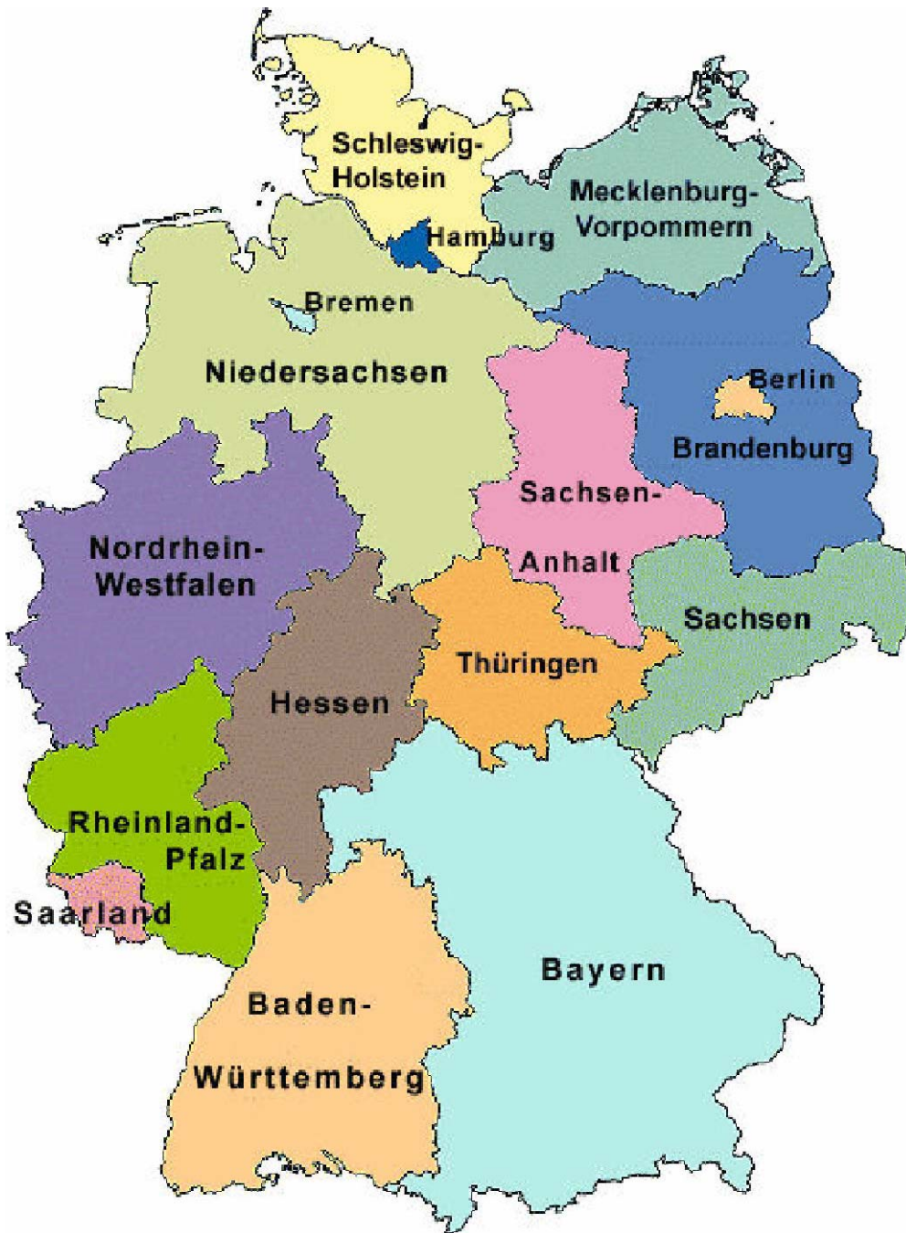
Germany – Present Day